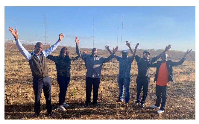
Our VOICE OF HOPE team worshiping the Lord and praying over our antenna and transmitter site in Zambia. Reaching 75% of Africa by radio! All glory to God!

Thank you for supporting and praying earnestly for what God is doing through Strategic Communications